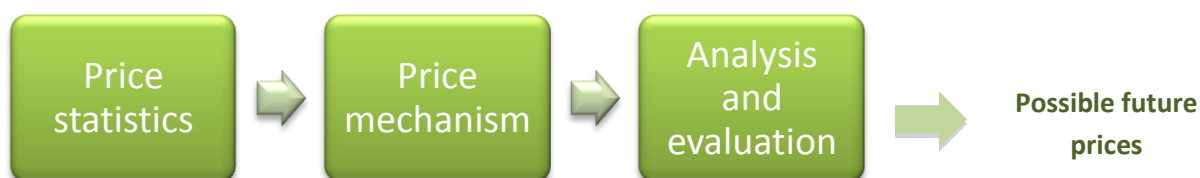
Figure 1. General methodology for BI of an energy carrier.

The objective of the BI presented here is to get knowledge and an understanding of the (local) energy market to support strategic energy planning. One key issue for energy strategies are estimates on future energy prices. Even though making estimates on future prices is a non-trivial task, it can be facilitated by knowing historical and today’s prices and understanding the price mechanism as well as having access to an analysis tool bar. Hence, one approach for BI can be summarized by Figure 1 and the check list below. The guidelines for BI presented here, follows the structure presented in Figure 1 and the check list, with one section for each step.